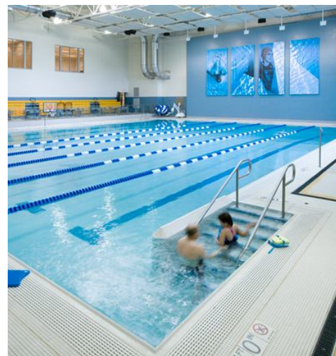
At right: Shepherd Pool